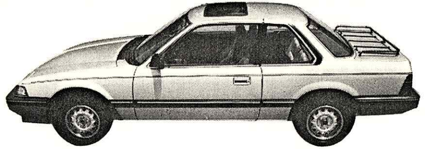
New Honda Prelude — with moon roof