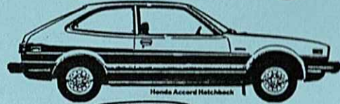
Honda Accord Hatchback