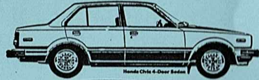
Honda Civic 4-Door Sedan

If not, before you buy any car, test drive the new Honda Civics, Accords, and Preludes at Richmond's #1 Honda dealer.