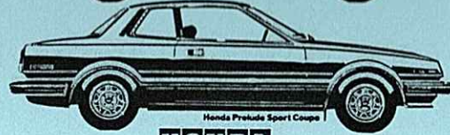
Honda Prelude Sport Coupe