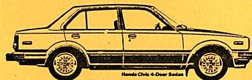
Honda Civic 4-Door Sedan

If not, before you buy any car, test drive the new Honda Civics, Accords, and Preludes at Richmond's #1 Honda dealer.