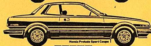
Honda Prelude Sport Coupe