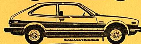
Honda Accord Hatchback