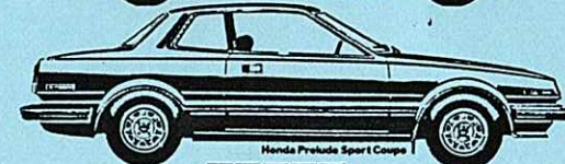
Honda Prelude Sport Coupe