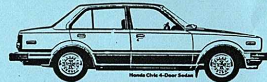
Honda Civic 4-Door Sedan

If not, before you buy any car, test drive the new Honda Civics, Accords, and Preludes at Richmond's #1 Honda dealer.