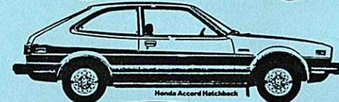
Honda Accord Hatchback