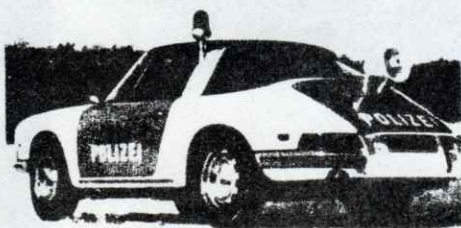
FUZZ BOMB is Porsche 5-speed Targa 911 convertible. Constabulary in eight European countries have adopted the speedy German sportster for use in pursuing—and catching—well-wheeled criminal types.

Having this nifty new line in Richmond is a quite a boon to car lovers and enthusiasts since we have never had a dedicated BMW dealer in this venerable old town. The boys at Boulevard are quite excited about their latest offering since they feel that sales and service facilities for the foreign car lover are somewhat less than optimum. However, the addition of BMW and their familiarity with all makes renders Boulevard quite unique in their appeal.