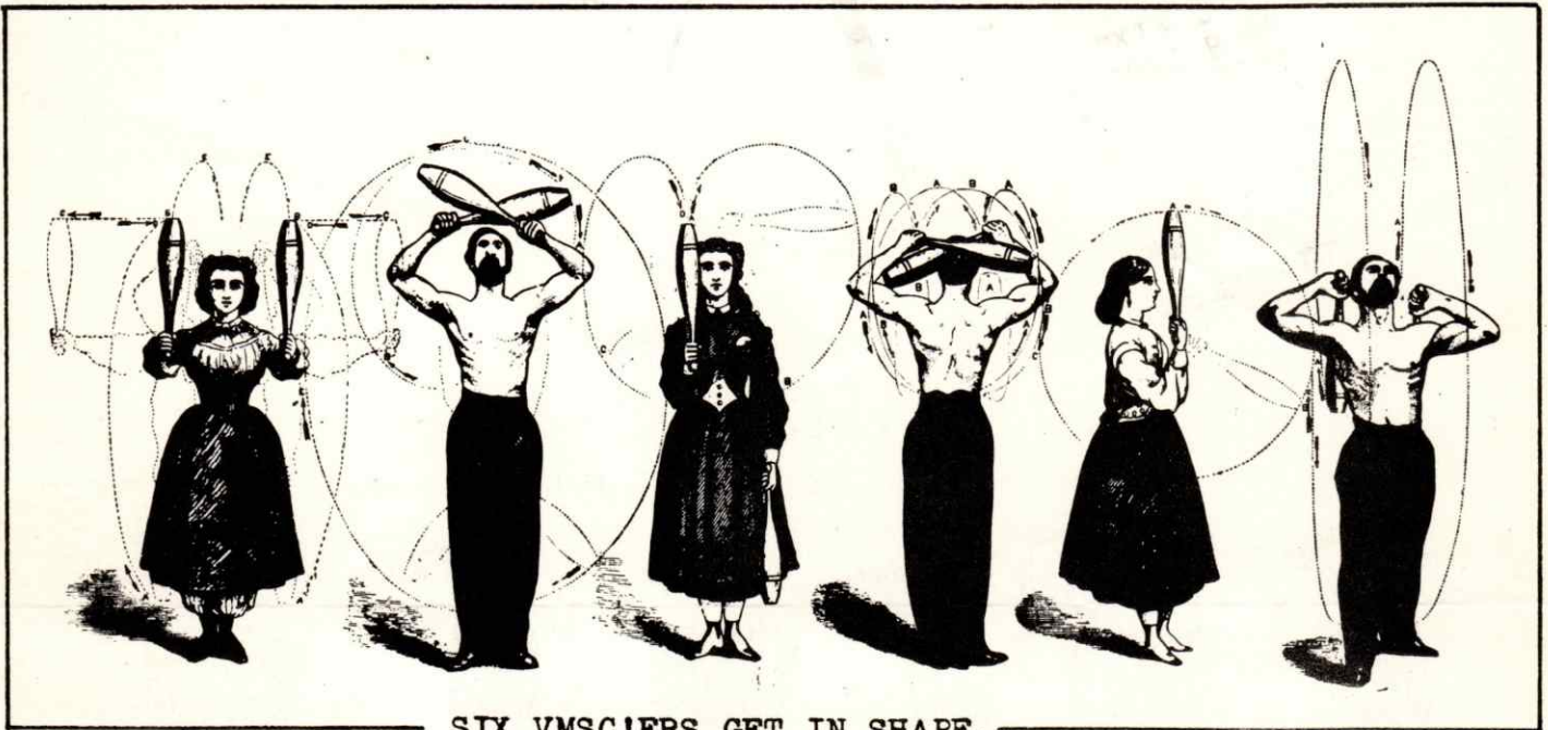
SIX VMSC'ERS GET IN SHAPE...